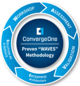
WAVES - Analysis before prescription